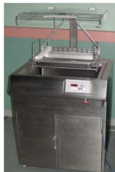
Ultrasonic Washer, lifter