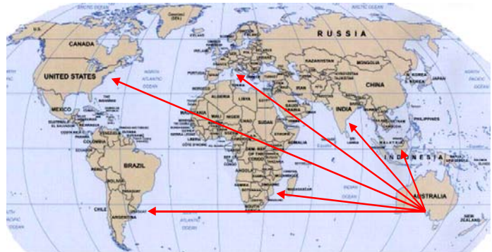
Regions Soniclean currently has distributors in